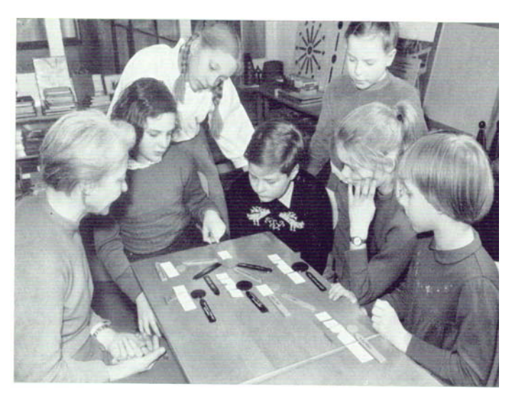
Montessori school in Frankfurt, 1956